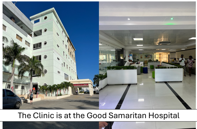
The Clinic is at the Good Samaritan Hospital